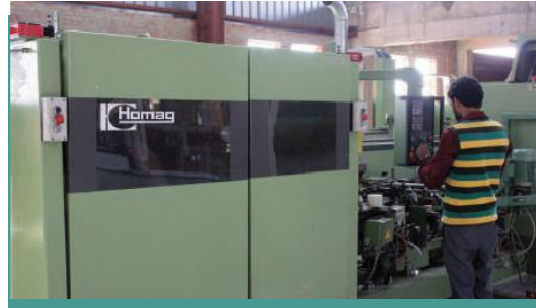
Edge Bending Operator