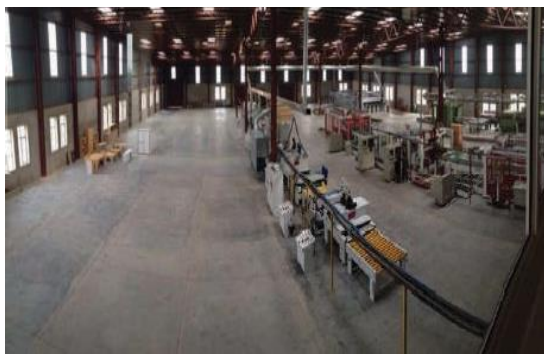
UV Finishing Line